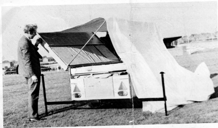
(3) Note the roof, self erecting and always covering the trailer