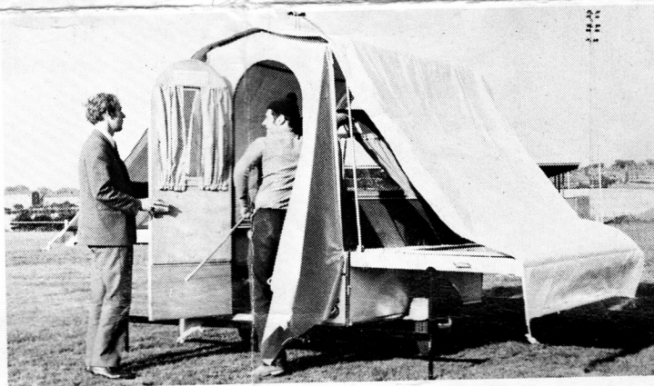
(6) Push up front section with roof pole and fix in socket