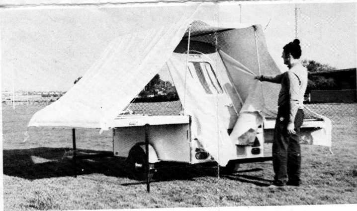
(5) Pull up door section and open door. This automatically locks upright.