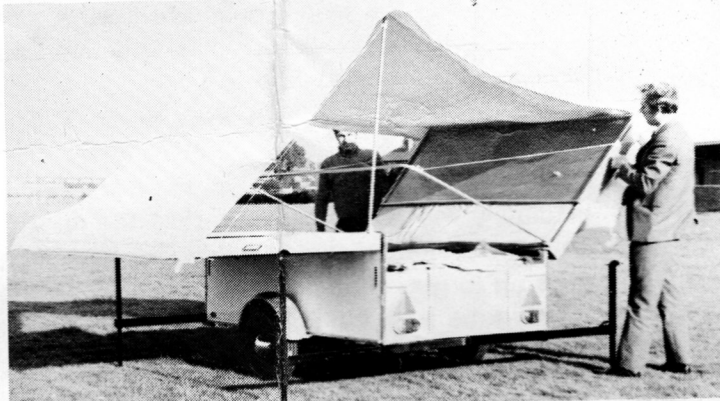
(4) Open second bed (note mattresses still in position undisturbed)