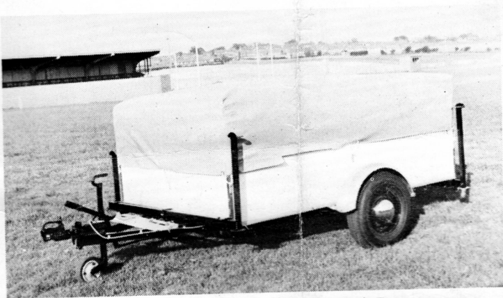
(1) Set Dandy level. Pull out jacks (self adjusting). Remove cover