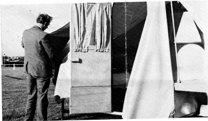
(7) Lift up side boards and hook in side panels